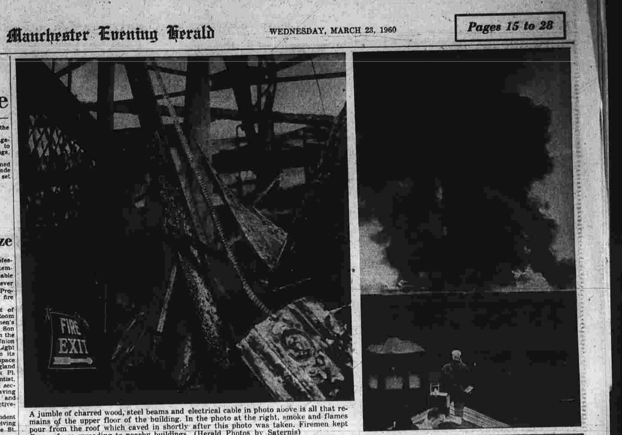
A jumble of charred wood, steel beams and electrical cable in photo above is all that remains of the upper floor of the building. In the photo at the right, smoke and flames pour from the roof which was cut shortly after this photo was taken. Firemen kept flames from spreading to nearby buildings.